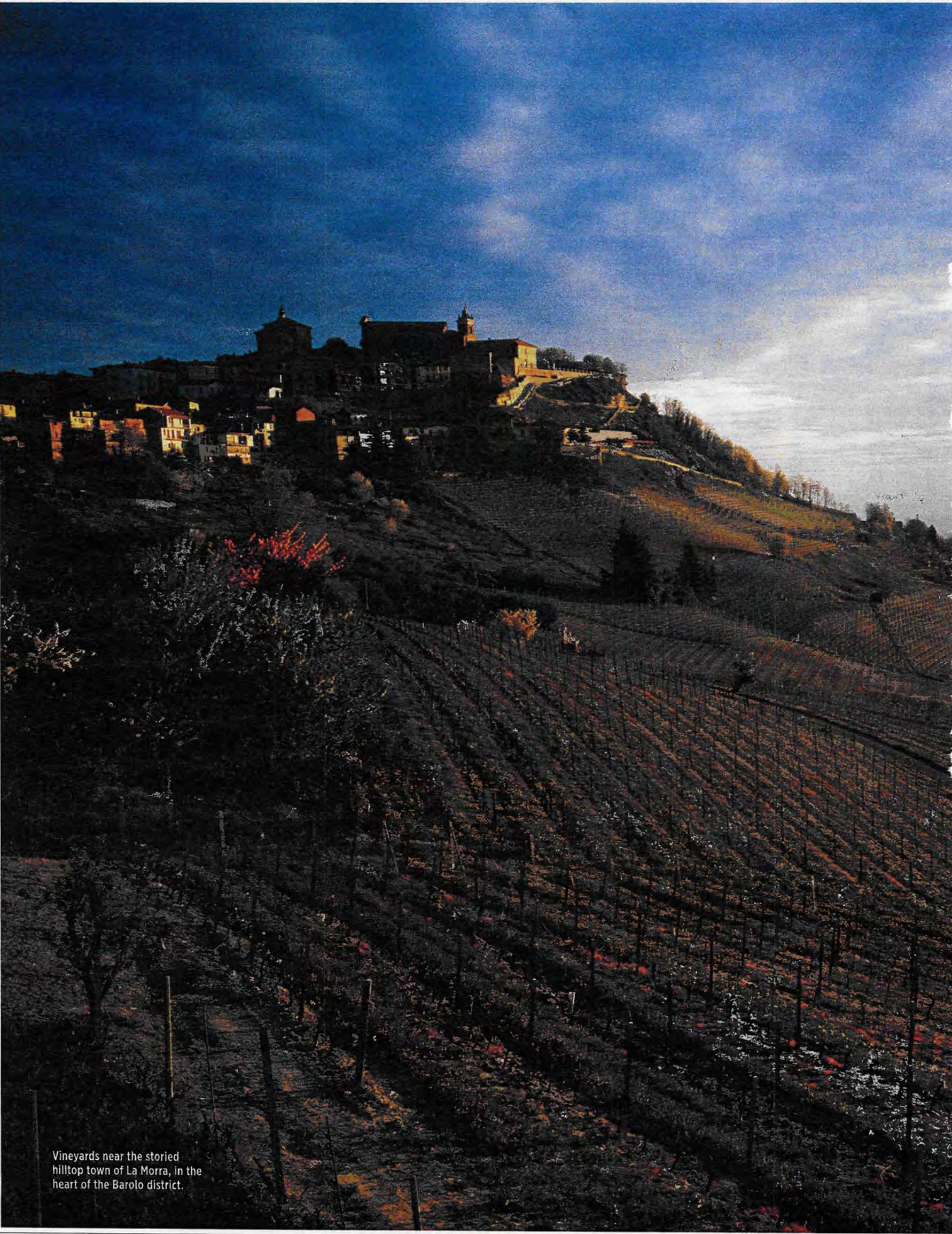
Vineyards near the storied hilltop town of La Morra, in the heart of the Barolo district.